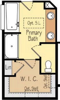
Soaking Tub Option